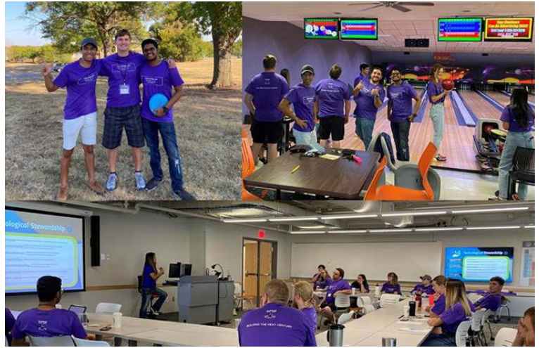
Chi Epsilon district conference