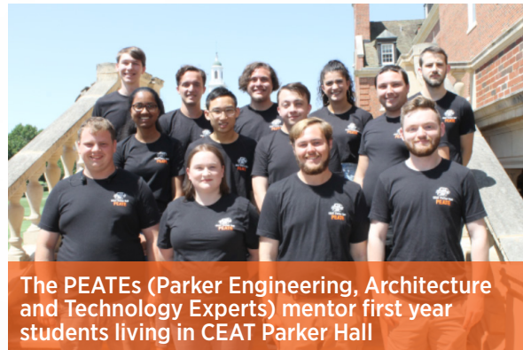
The PEATEs (Parker Engineering, Architecture and Technology Experts) mentor first year students living in CEAT Parker Hall

Student Academic Services 110 Engineering North & 109 ATRC Stillwater, OK 74078 405-744-5276 studentservices.okstate.edu