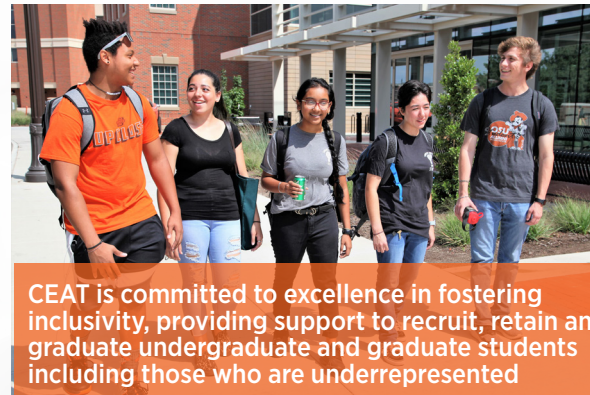
CEAT is committed to excellence in fostering inclusivity, providing support to recruit, retain and graduate undergraduate and graduate students including those who are underrepresented

When students are struggling in class, instructors notify our staff. We then contact the students about the report via email, telephone, text message (sometimes all three) to help resolve the issue.